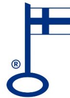
Image 9: Hyvää Suomesta/Produce of Finland logo Image 10: Avainlippu logo