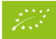
4: EU organic logo

Other energy labels and eco-labels include the Energy Star label used in the EU and USA (image 5) and the international EKOenergia ecolabel (image 6).